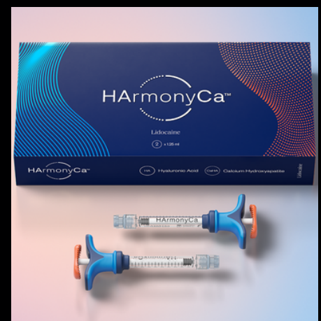
HArmonyCa® Treatment Kit

Natural-Looking Results: Designed to integrate seamlessly with your facial structure, HArmonyCa™ enhances your features without altering your natural expression.